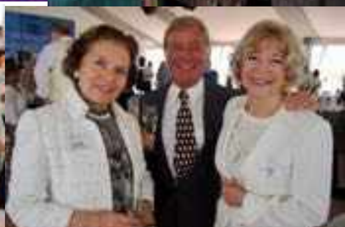
May – Festive Club Lunch in Cannes during the 72nd International Film Festival – 96 guests