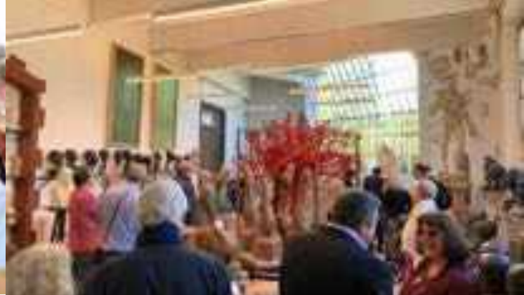
April – Guided tour of Château de la Napoule and lunch – 44 guests