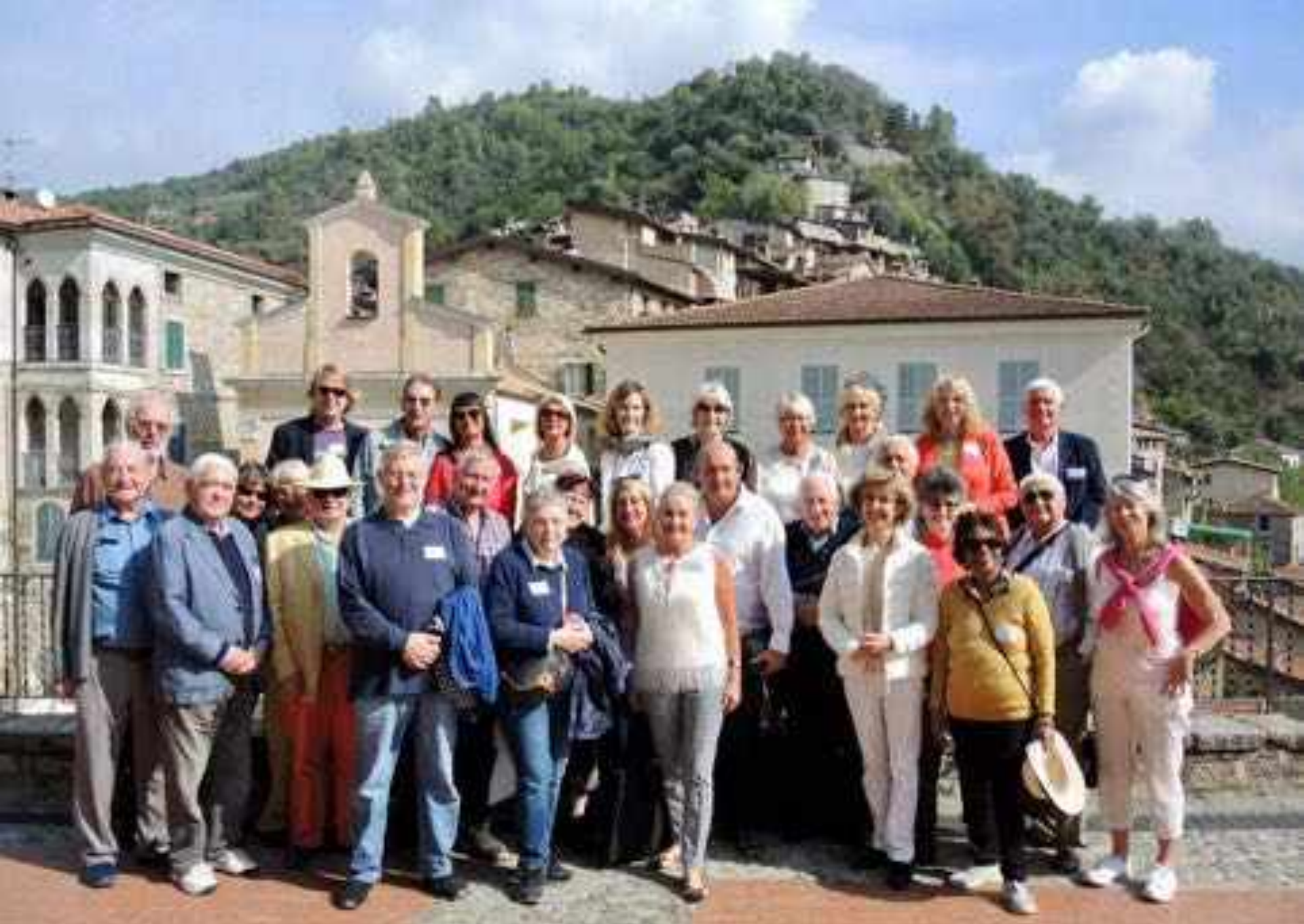
October - Visit of the medieval village of Apricale, Italy – 40 guests