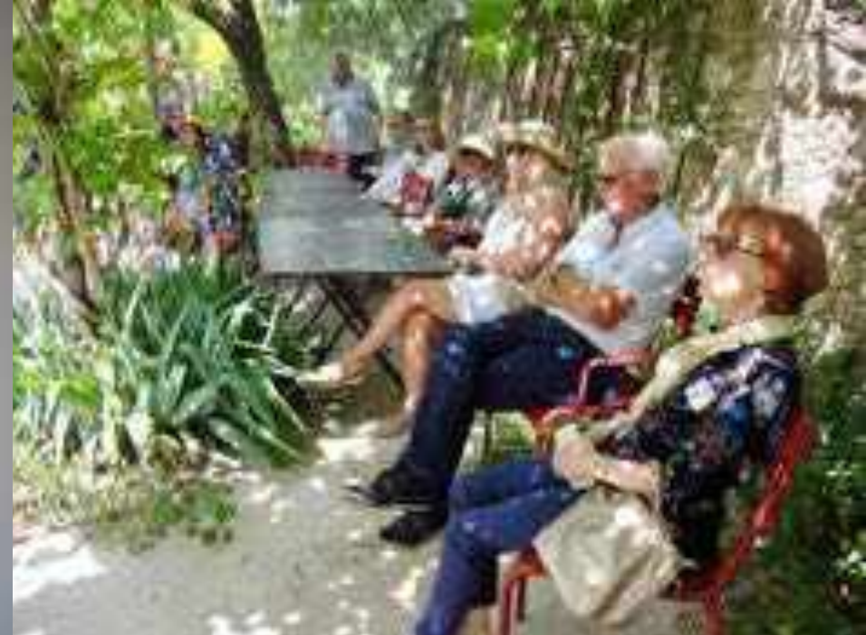
June - Tour of International Perfume Museum Gardens in Mouans-Sartoux + lunch – 40 guests