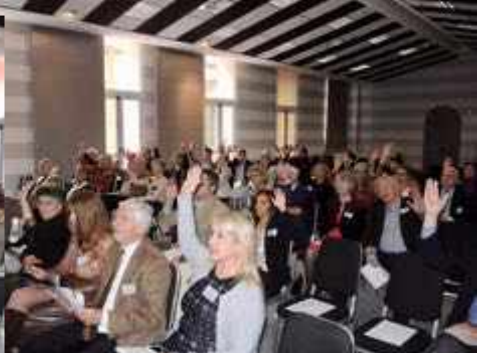
JANUARY - THE ANNUAL GENERAL MEETING - 51 guests