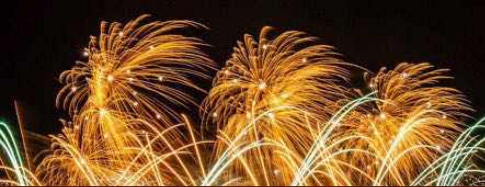
August - Annual Cannes Pyrotechnic Art Festival and Dinner on the Croisette Beach – 81 guests