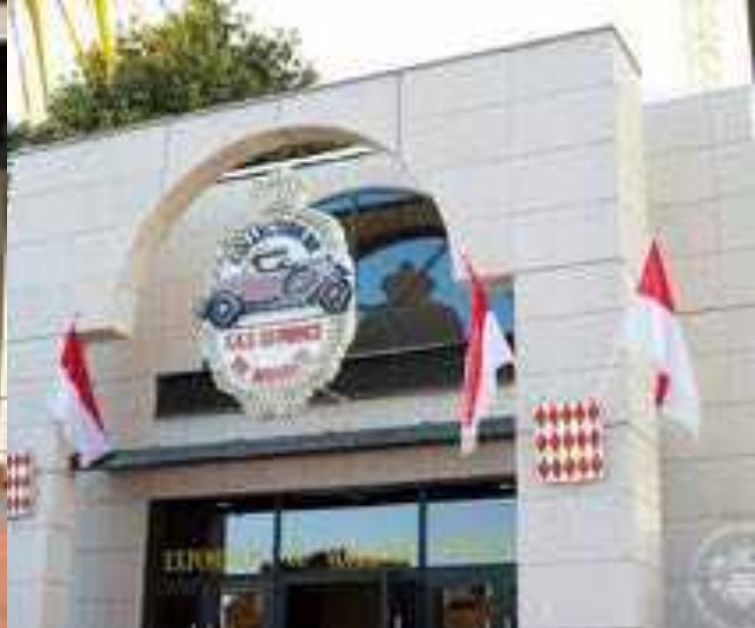
February – Visit to the car collection of H.S.H. Prince Albert of Monaco + lunch - 55 guests